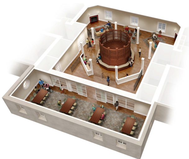
Rendering of third floor 'Birdcage' social and study space.