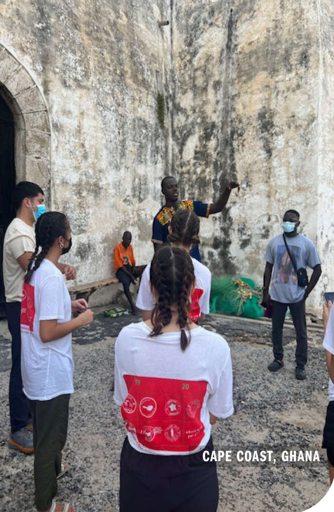
CAPE COAST, GHANA