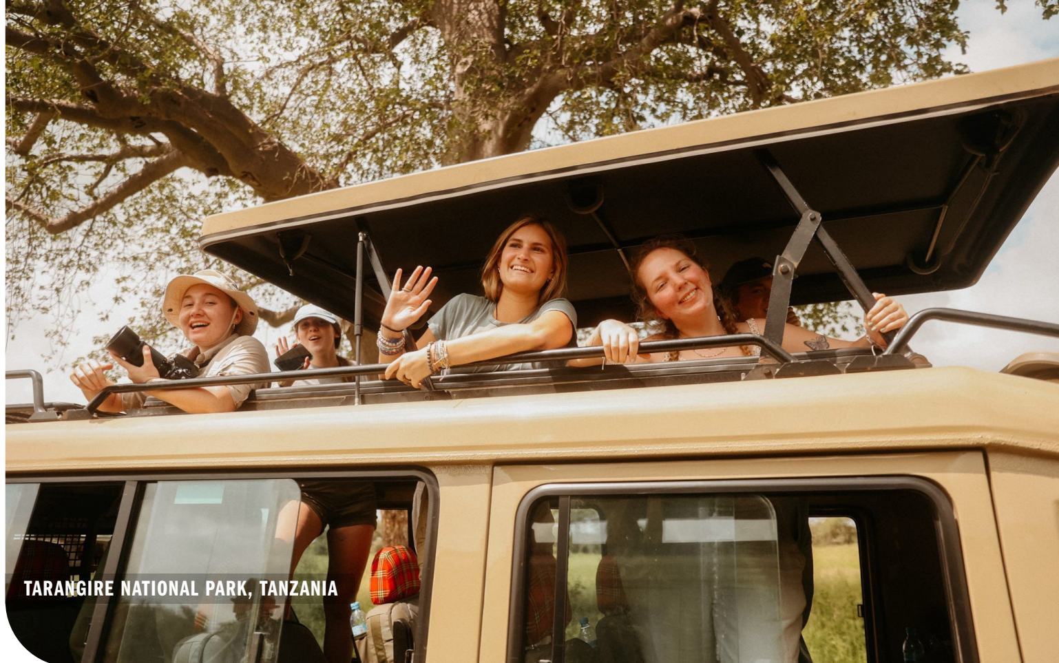
TARANGIRE NATIONAL PARK, TANZANIA