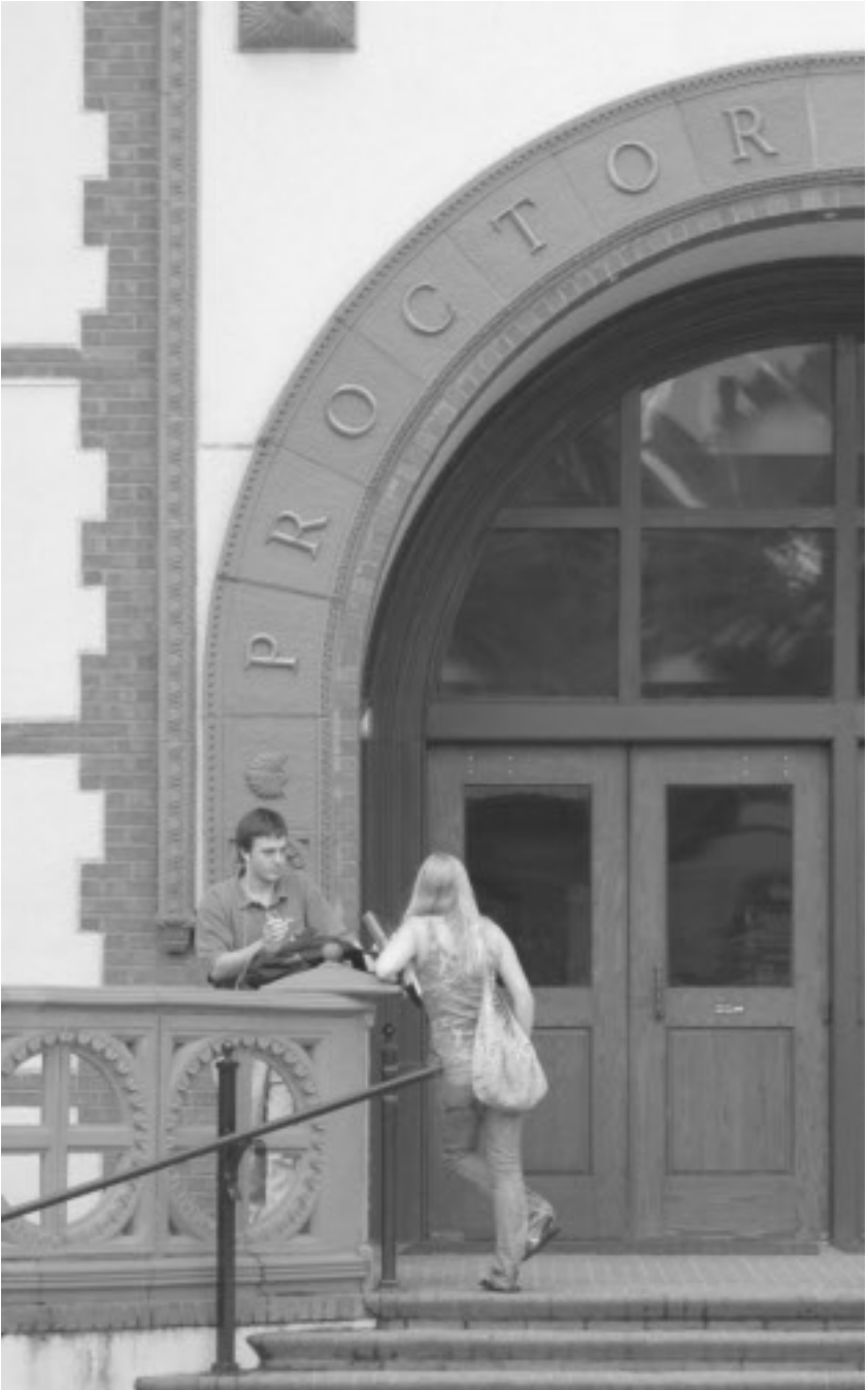
One of Flagler College's goals is to provide a healthy, safe, secure, and inviting campus environment for students, faculty, staff, and visitors.