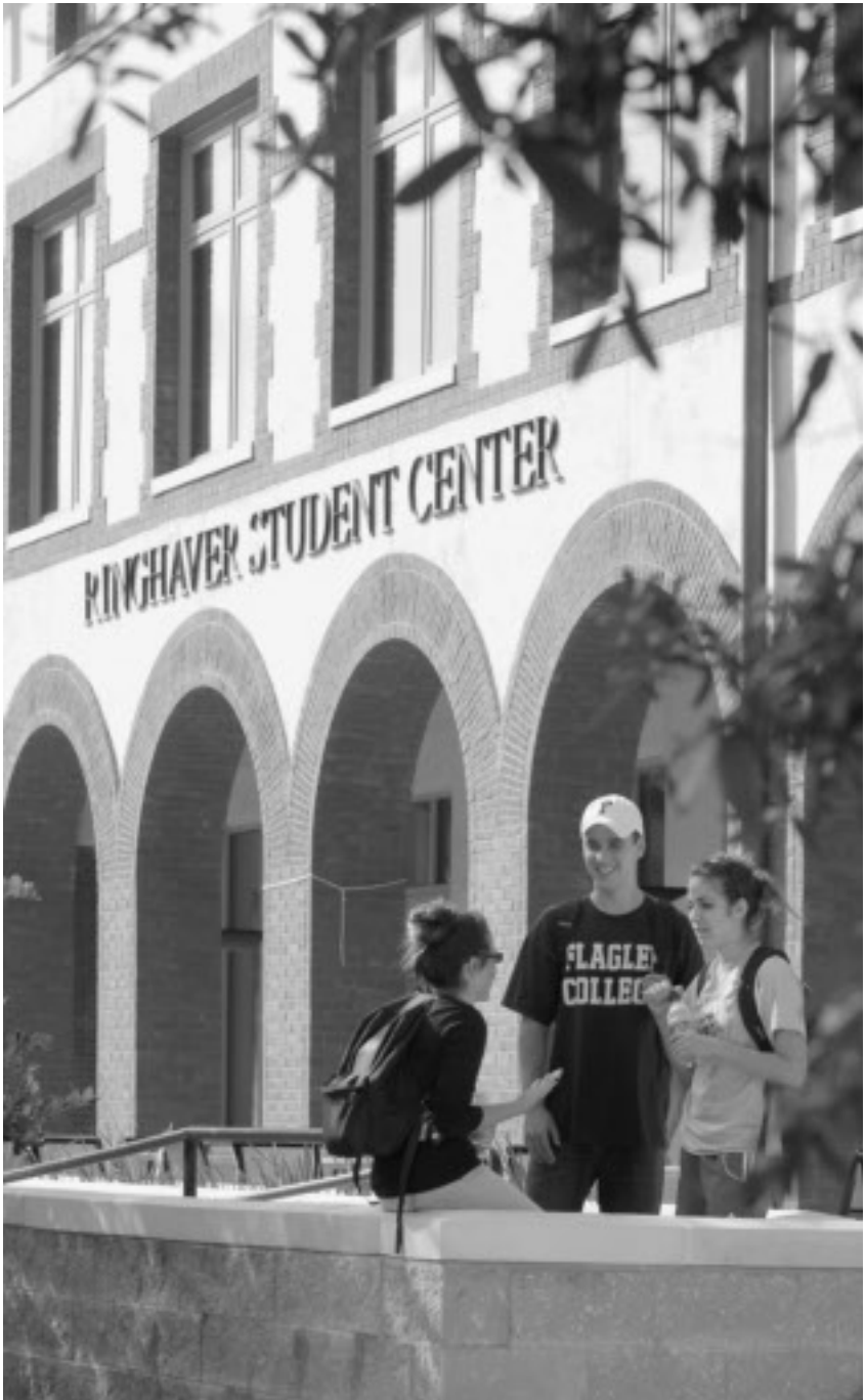
The Ringhaver Student Center provides areas for student interaction outside of the classroom, with three lounges, game tables, a food court, the College Bookstore, classrooms and a large multipurpose room.