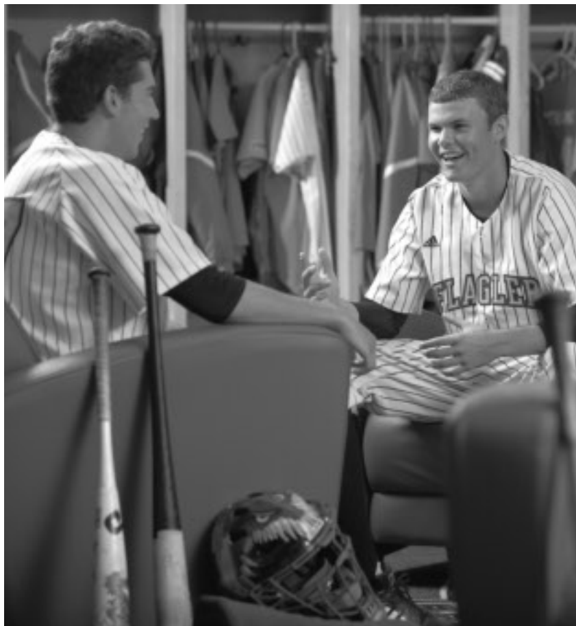
A 19-acre athletic complex located two miles from the College campus and is home to the men's and women's soccer, baseball and softball teams.

conducting effective job searches. Each student is offered individualized support in defining and attaining career objectives. From individual counseling sessions and walk-in availability to group workshops and employer presentations, the Office of Career Services is dedicated to helping students plan for the future as well as to providing the knowledge and tools necessary to put those plans into action. Services include exploration of careers, graduate schools/programs, career goals, and information concerning career fields, employment opportunities, interviewing, resumes, internships, networking, and job search strategies. The Career Services Resource Library provides a large variety of books on career planning, job search strategies, and graduate school admission. In addition, students can pick up free informative handouts and publications from leading associations and companies; review current employment opportunities; access computerized career guidance programs; research salary and employer information; and meet with advisors for one-on-one assistance in any of these areas.