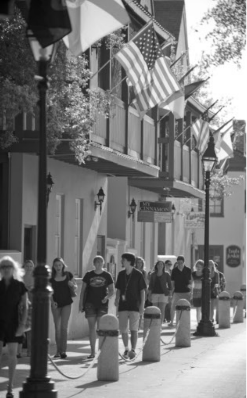
The Flagler College campus, in the nation's oldest city, is within walking distance to the Restoration Area and other historic points where students love to spend their free time relaxing and socializing.