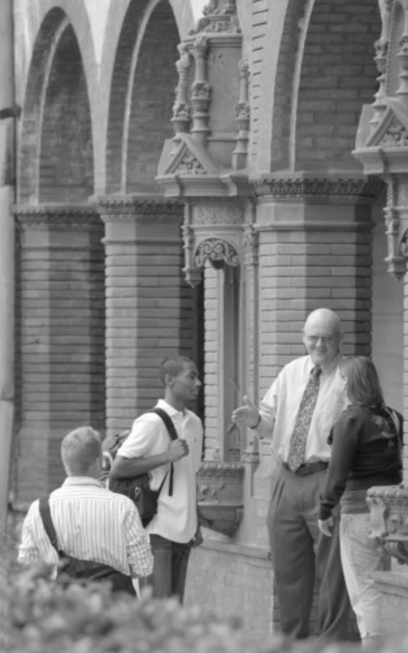
The College seeks to attract and retain a professionally competent faculty, dedicated to the art of teaching and advising, committed to high standards of performance, and concerned for the welfare of the College and its students.