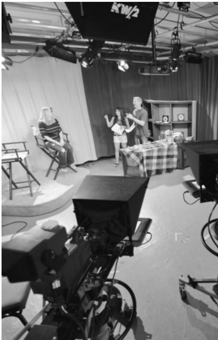
Flagler College Television (FCTV) is a student-run television production company, with programs including a news magazine show, programs covering the Flagler College forums, and numerous nationally recognized guest lecturers, as well as original student productions.