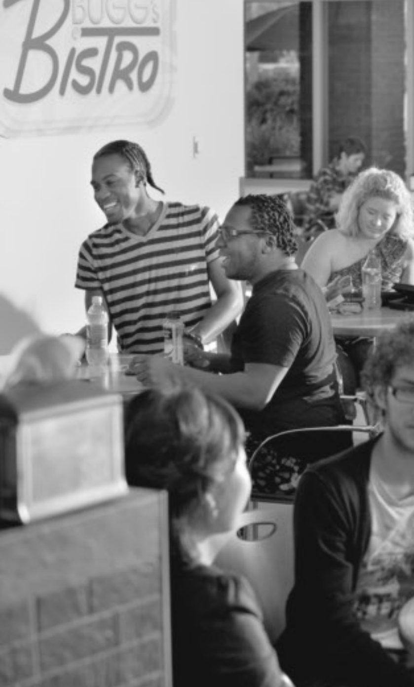
Bugg's Bistro is in the Ringhaver Student Center, centrally located between the three residence halls and down the street from the Proctor Library.