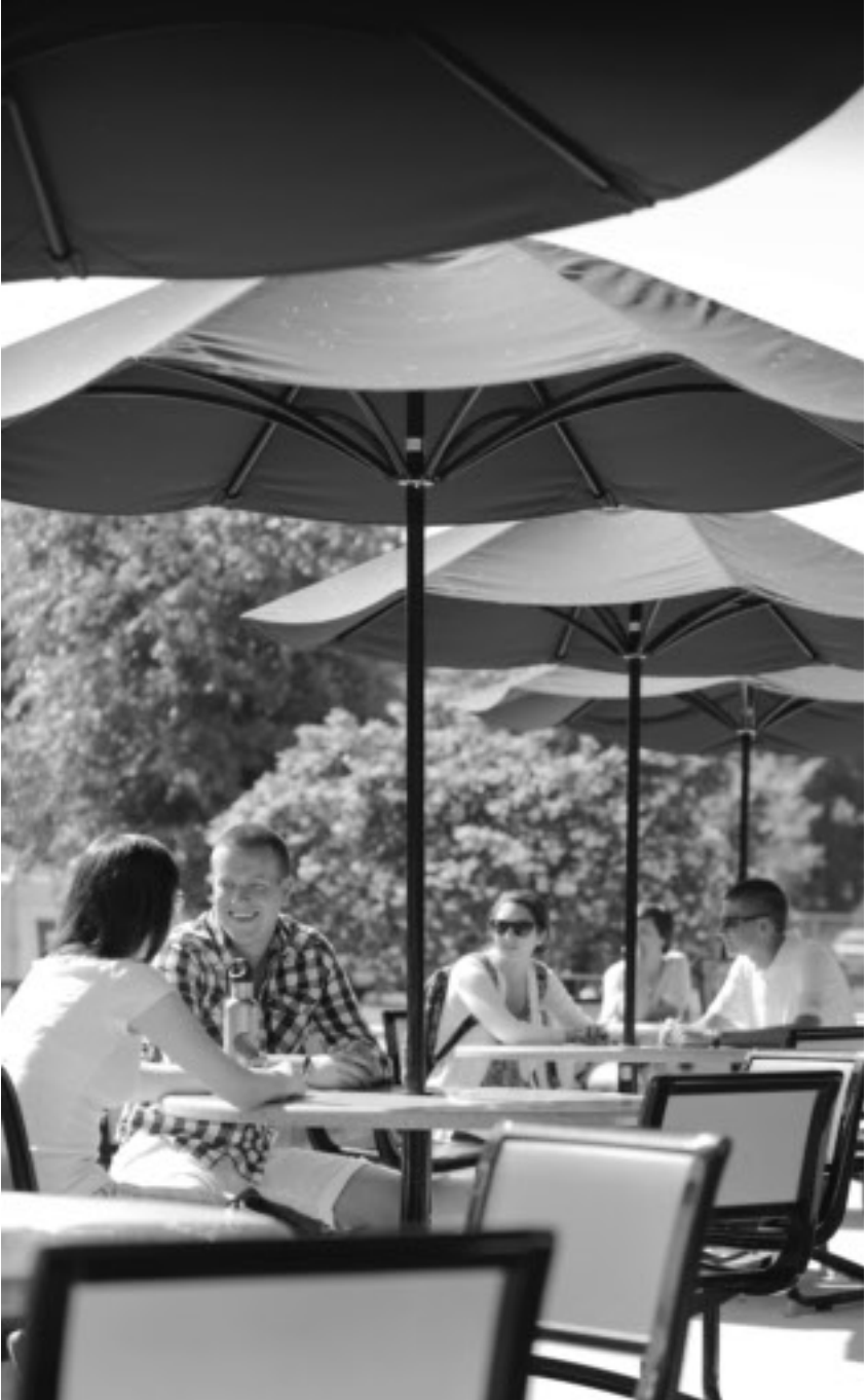
Students enjoy congregating at the outdoor dining/lounge/study area of the Ringhaver Student Center, taking advantage of St. Augustine's comfortable weather.