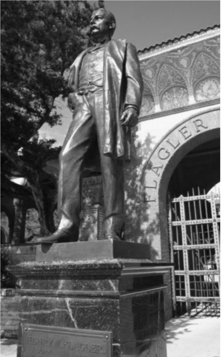
Founded in 1968, Flagler College was established as a memorial to Henry M. Flagler, the single most pivotal figure in Florida's early development.