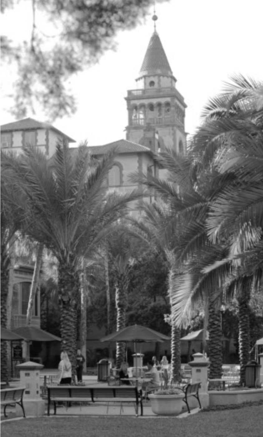
Kenan Plaza is a popular outdoor gathering place crowned by towering palm trees, adjacent to Kenan Hall, the College's principal academic facility.