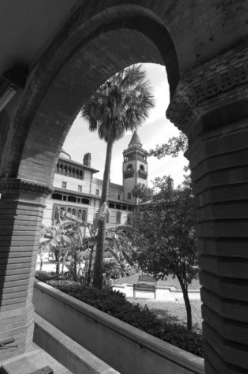
The centerpiece of the Flagler College campus is the former Hotel Ponce de Leon, a grand resort built in 1888 by Henry M. Flagler, industrialist, oil magnate, land developer, and railroad pioneer.