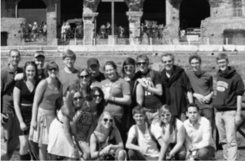
Students and faculty share unique learning experiences in the International Study Abroad Programs, which combine touring with instruction in rich cultural settings.

The above criteria also apply to Flagler College Faculty Led programs with one exception: Flagler College faculty led programs require the student to have attempted 24 credit hours.