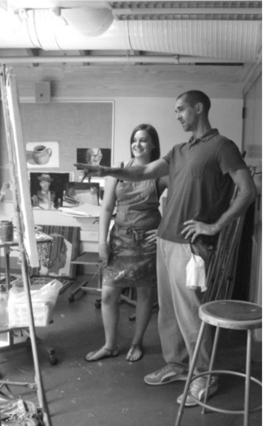
Flagler College strives to provide quality education at a reasonable cost, with a goal of making higher education affordable to as many students as possible.