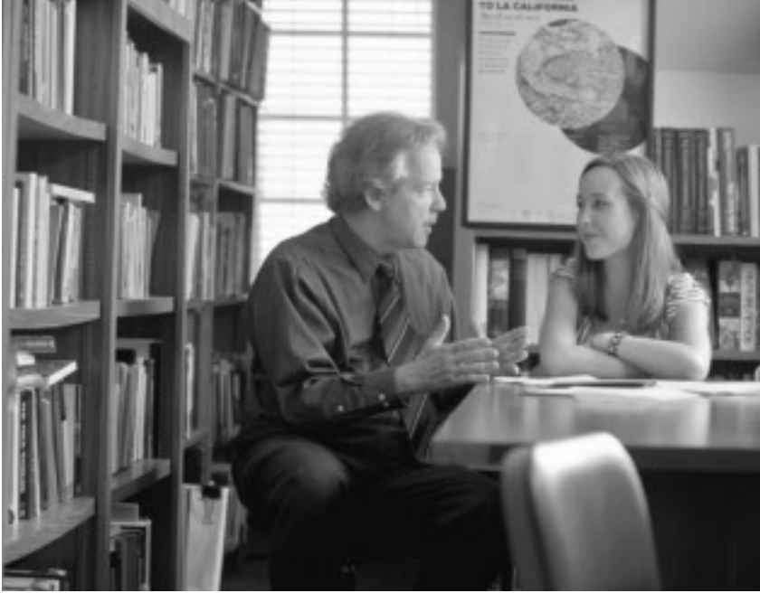
The frequency and quality of faculty-student contacts are increased at a small college like Flagler.