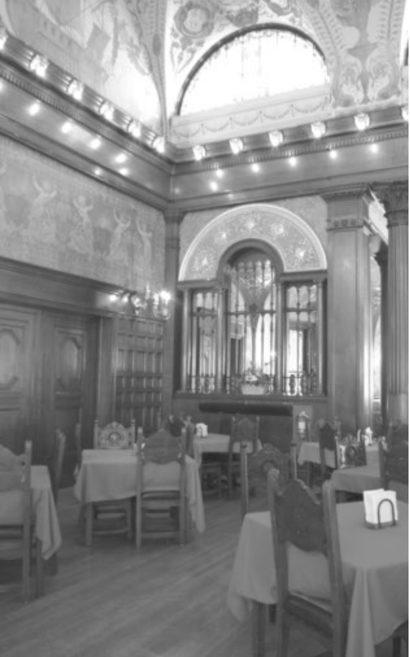
The impressive interior of the College's main building showcases ornate hand-carved wood, panels of imported marble, elaborate murals, and Tiffany stained glass windows, as chosen by Henry M. Flagler, the single most pivotal figure in Florida's development.