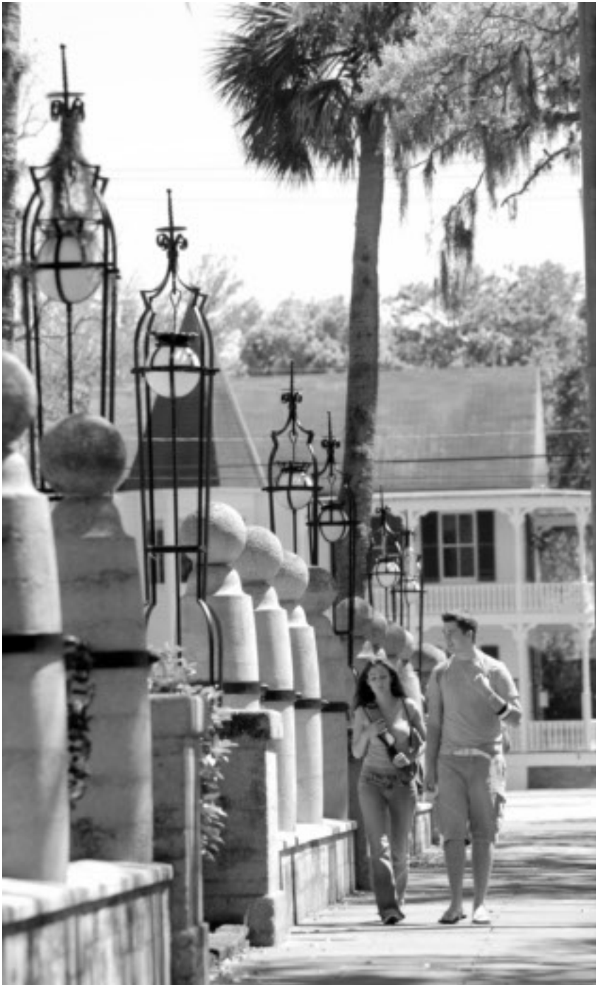
The distinctive Flagler College campus is located in the heart of St. Augustine, the nation's oldest city, and is close to numerous points of historic interest.