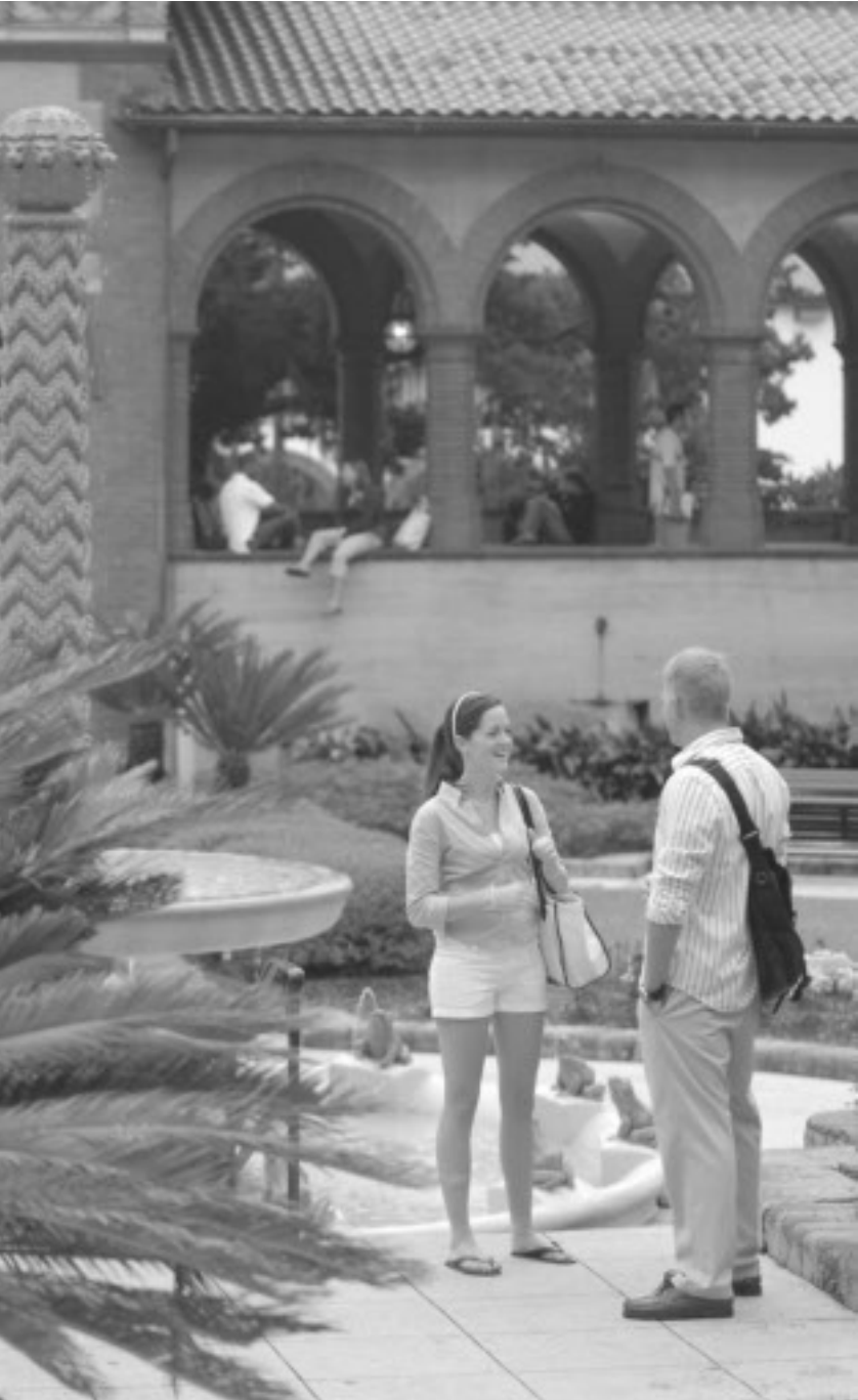
Students are surrounded by the unique historic buildings of Flagler College, hailed as one of the best examples of Spanish-Moorish Renaissance architecture in the world.